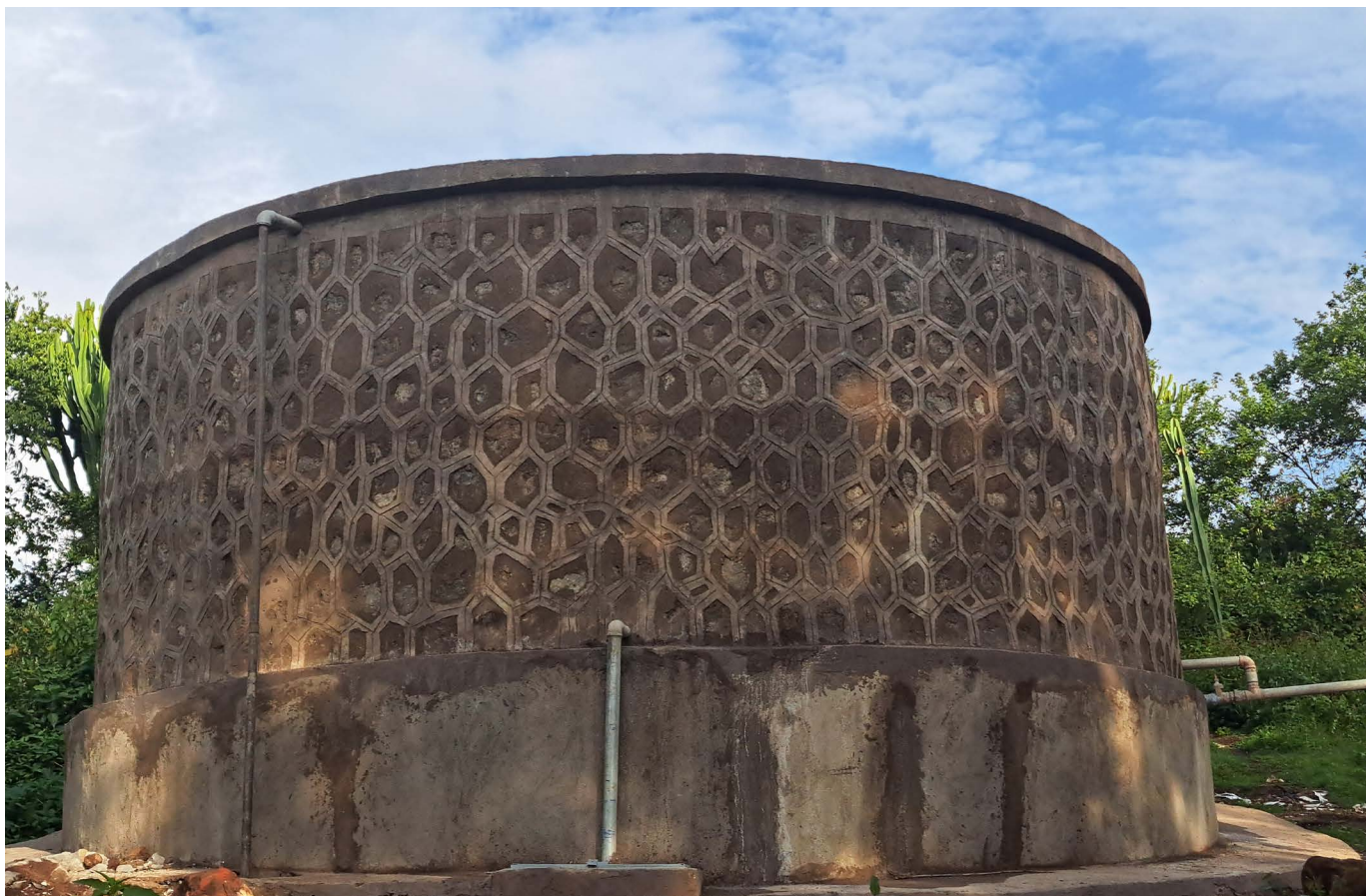
Newly constructed water reservoir nearing completion