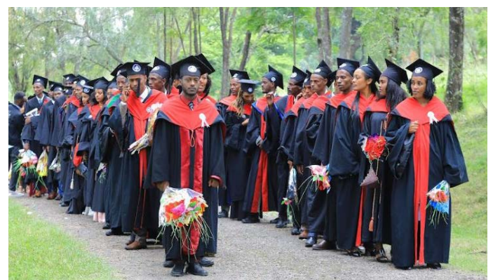
MBA Graduands during the procession