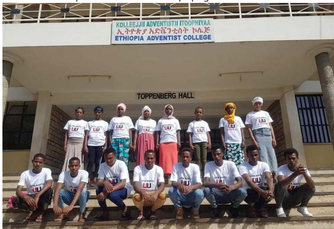
Some of the student beneficiaries of UWF sponsorship