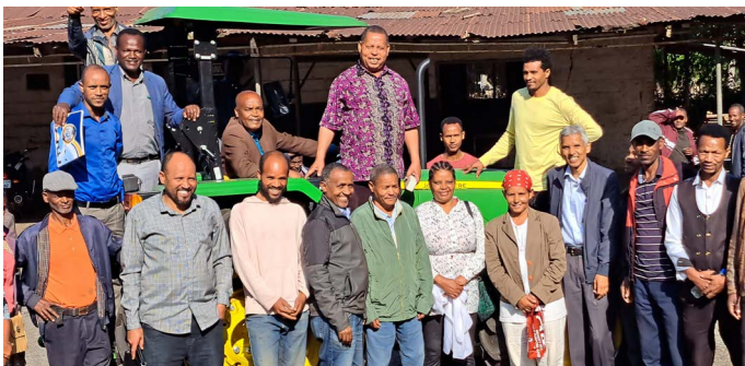
EAC staff and faculty pose with the newly donated tractor