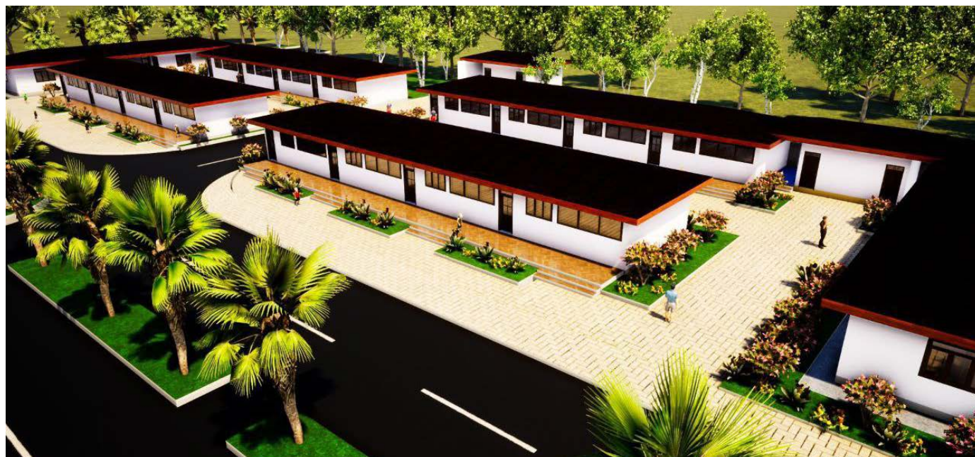
3D artistic impression of Kuyera international Adventist Academy

The cost of the eight new classrooms was 7,516,700 Birr. The building project was started in April 2023 and was completed in October 2023. Construction of 10 toilet rooms for the new buildings is near completion. The next phase of building includes classrooms for Grades 1-4.