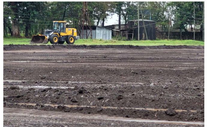
The soccer field under construction