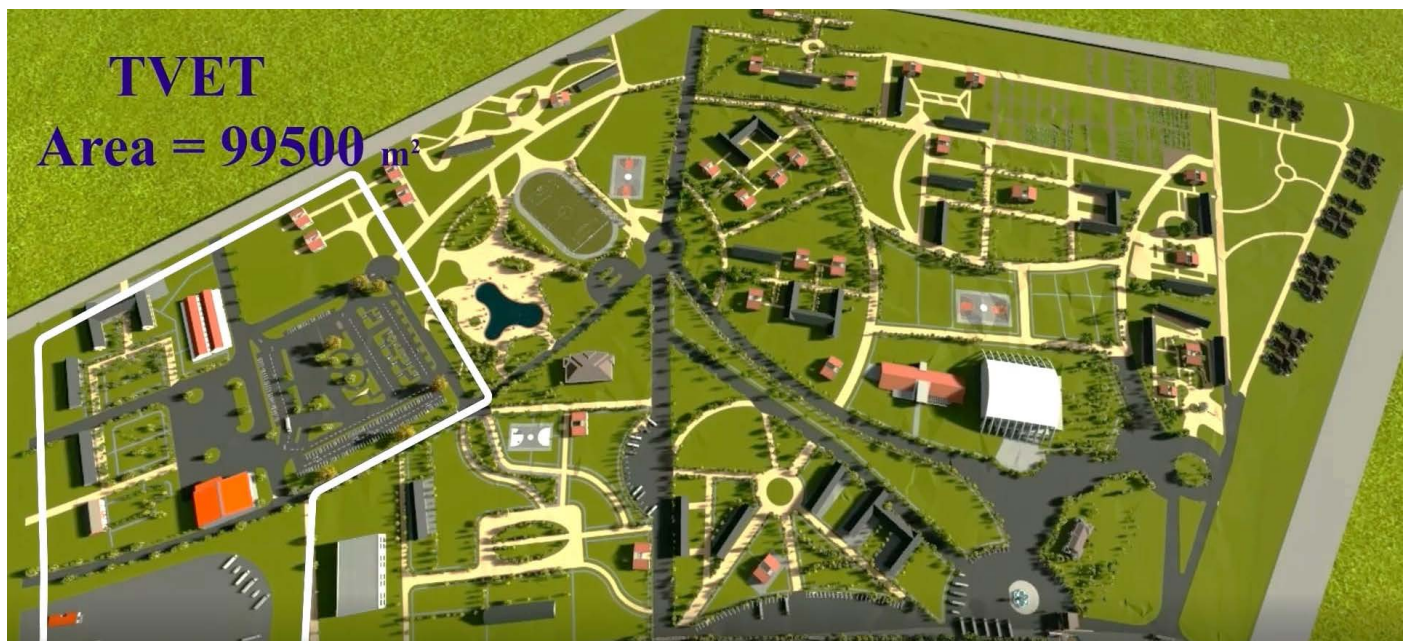
3D impression of the future Kuyera Adventist University (KAU)

A special thanks goes to the 1000 EAC Vision Club who have donated and pledged to give $1000 toward the University project. Thank you for supporting the building of God's work in Ethiopia and may the LORD richly reward you for your liberal and bountiful contributions.