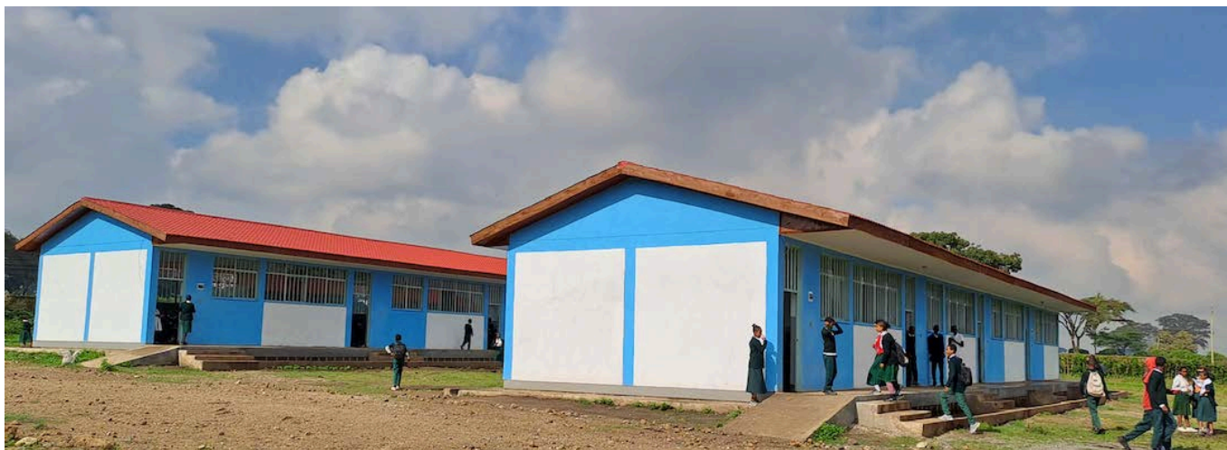
Two completed buildings

The buildings for Kuyera International Adventist Academy have already begun. Two new building of four classrooms each (a total of eight classrooms) were completed just in time for the new school year 2023-2024 for the Overseas Elementary School.