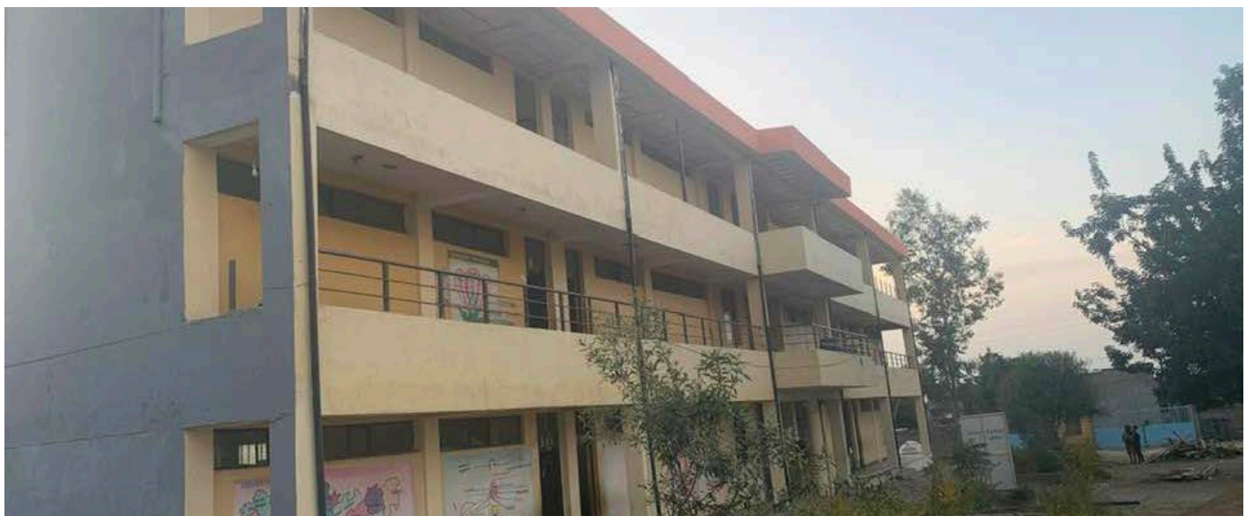
Completed building of Shashemene Adventist Academy