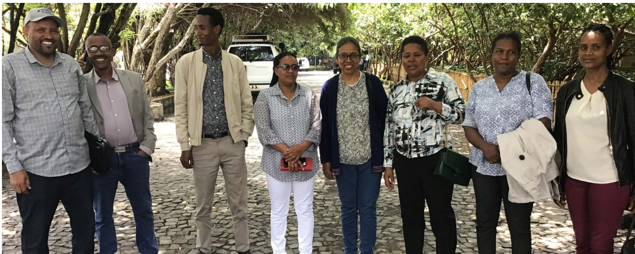
EAC faculty and staff at Akaki Adventist School