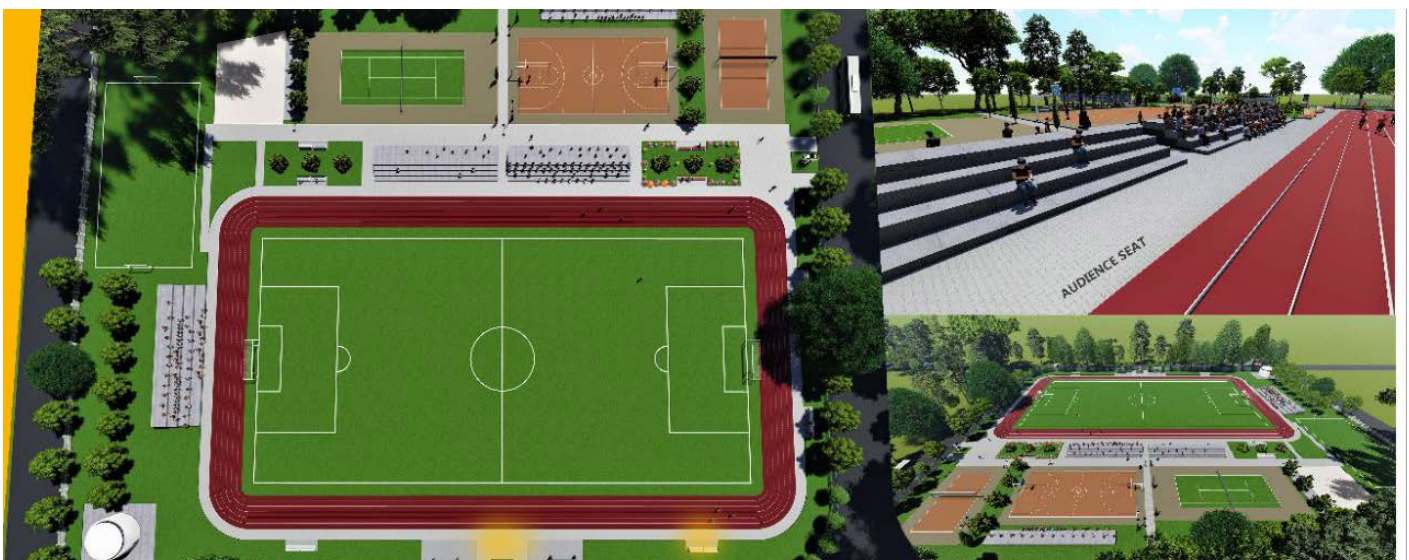
3D artistic impression of the soccer field under construction