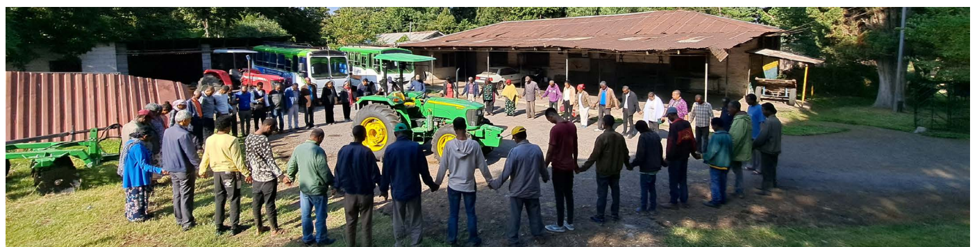
Thanks giving prayer for the new tractor