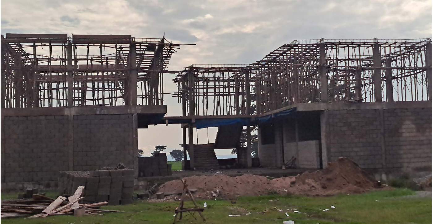
Part of TVET building under construction

The Technical and Vocational Education and Training (TVET) in Ethiopia is a popular program with the aim to create competent and self-reliant citizens who can contribute to the economic and social development of the community and further reduce poverty.