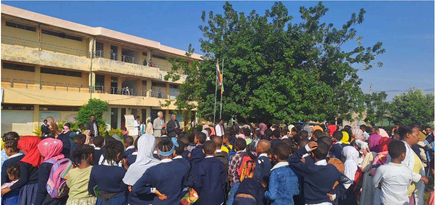
Students at the assembly during the First day of the school year 2023-2024 at Shashemene Adventist Academy.

The Shashemene Adventist Academy which is a part of EAC, completed a third floor of the school building by the help of donations from EAC alumni and friends.