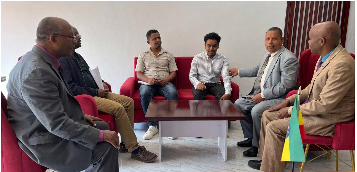
ETA members at the president's office for MBA re-accrreditation

Federal Democratic Republic of Ethiopia (FDRE) Education and Training Authority (ETA) visited EAC to renew program license for Educational Program Management (EDPM) on August 18, 2023 and Masters in Business Administration (MBA) on October 6, 2023.