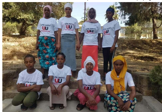
Some of the student beneficiaries of UWF sponsorship