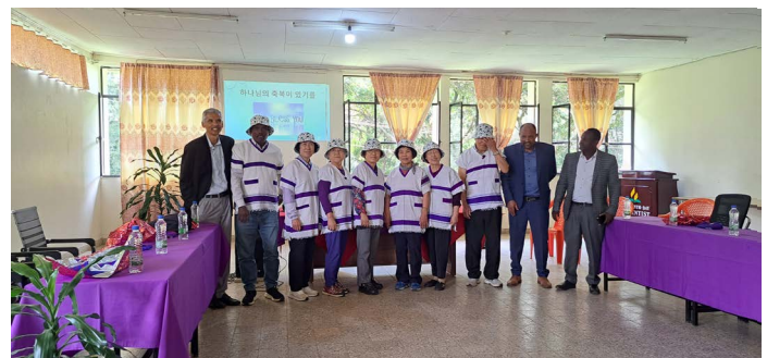
Korean donors with EAC officers