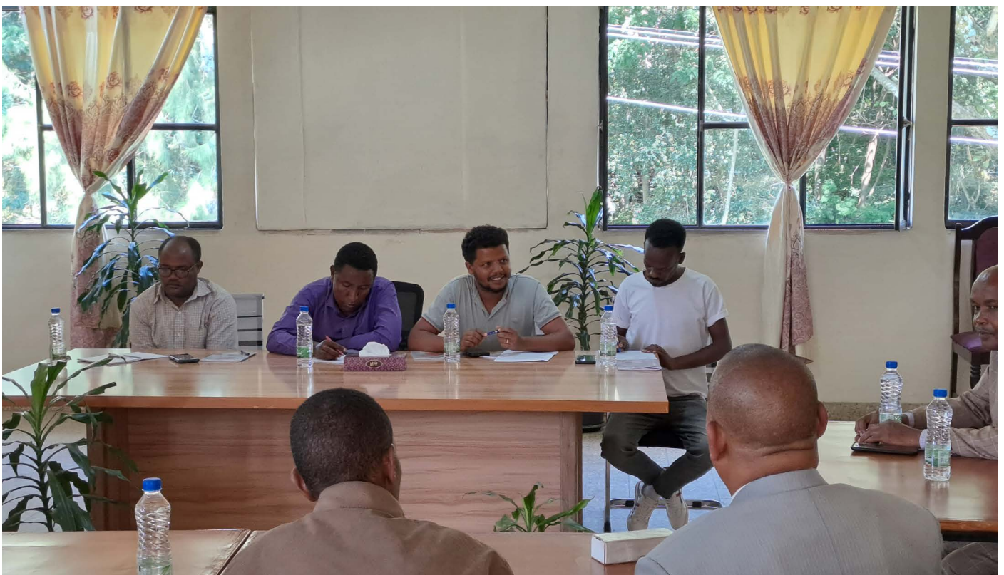
ETA members at conference center for EDPM re-accrreditation

Federal Democratic Republic of Ethiopia (FDRE) Education and Training Authority (ETA) visited EAC to renew program license for Educational Program Management (EDPM) on August 18, 2023 and Masters in Business Administration (MBA) on October 6, 2023.