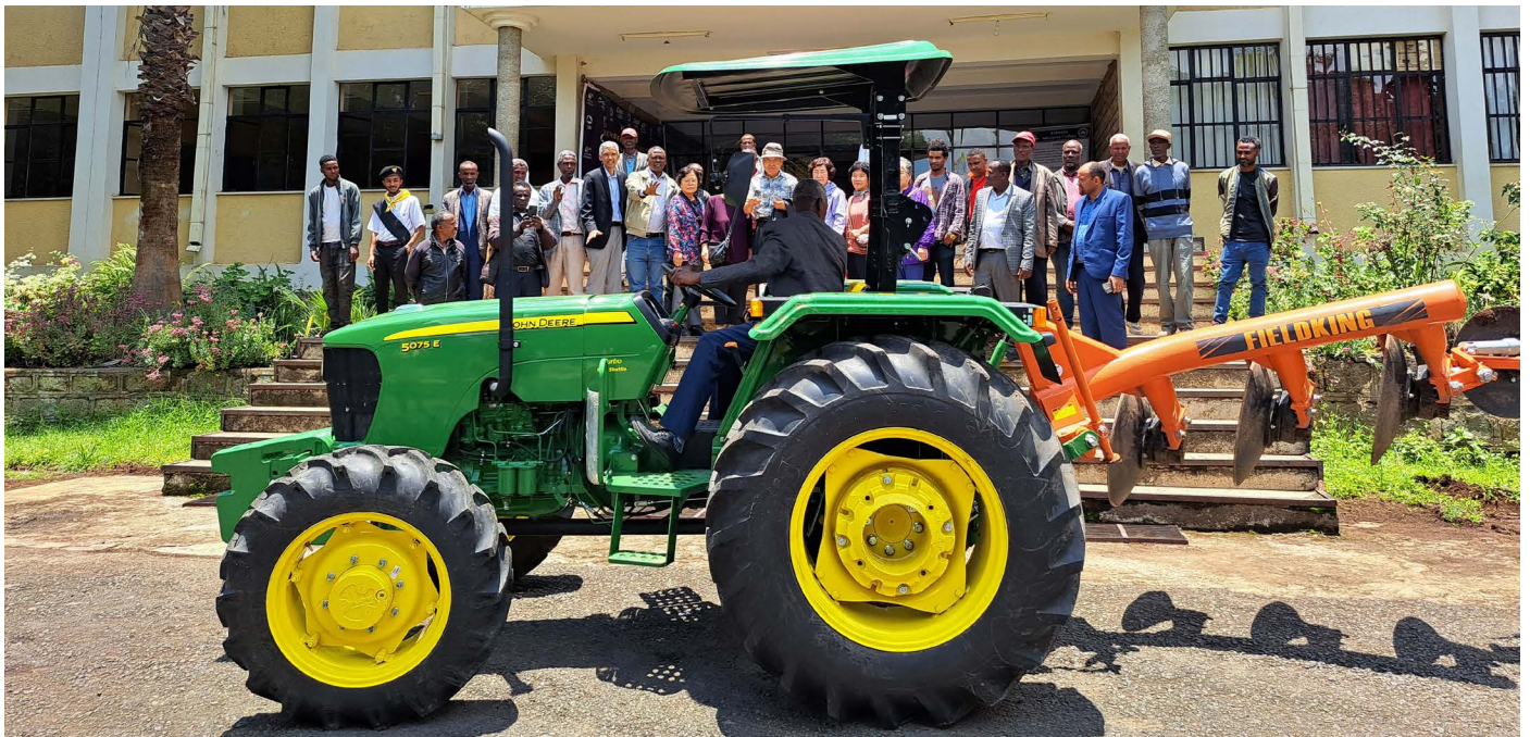
Korean donors, EAC staff and faculty, with the new John Deere tractor in front of Toppenberg hall

Ethiopia Adventist College was blessed to have received a donation of a new 75 HP John Deere Utility tractor. The tractor, a donation through the Korean Union Conference of the Seventh-day Adventists, will be a huge asset to the 182 hectares of land that is occupied by the college.