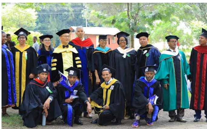
Faculty and Staff members' group photo on graduation day