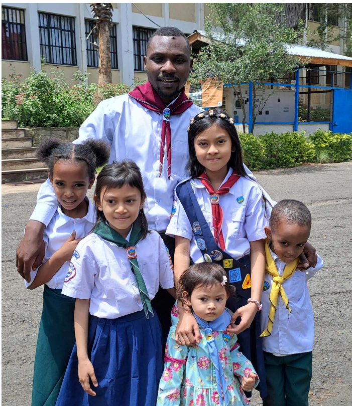
Celebrating World Adventurer Day on 20th May 2023